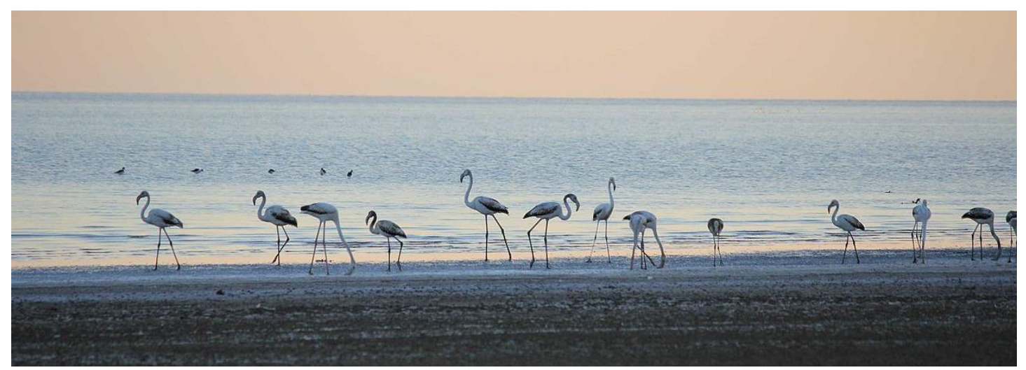
Flamingos near Dholavira

<u>Day 17 - Thursday, February 22</u>: On the road again, and today's destination is another relatively small town, located about 300 km from Dholavira, Gondal, once an important one of the princely state that became part of British India but continued to be ruled by its lords of the Rajput dynasty. Upon arrival there, we will visit their Naulakha Palace, built in the 17th century and known for its stone carvings and exquisite balconies, before checking into Hotel Orchard palace.