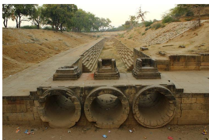
Rani Ki Vav stepwell and the Sahasralinga Tank in Patan

Day 15 - Tuesday, February 20: Rann means "desert" and Kutch (or Kuchchh) is a district of Gujarat. The Rann of Kutch, consisting of the Little and the Big Rann of Kutch, is a vast region of salt marshes straddling the border between the State of Gujarat and Pakistan's Sindh Province; it is a flat region, very close to sea level, watered by many rivers and flooded annually during the monsoon season, i.e. from June to September' the waters evaporate during the long dry season, leaving the Rann dry again, morphed into salt desert but also grassland, both of which attract wildlife. Today we enjoy a full-day jeep safari into the Little Rann of Kutch, a salt marsh and biosphere reserve that is home to the Asiatic Wild ass, popularly known as Ghudkhar. as well as many species of migratory birds, e. g. cranes, ducks, pelicans, spoonbills, and flamingoes, falcons, eagles, and vultures, as well as mammals such as the Indian wolf, desert fox, gazelles, jackals, and nilgai, Asia's largest type of antelope. The Wild Ass Sanctuary of Little Rann of Kutch has been placed on the UNESCO's tentative list of World Heritage Sites.