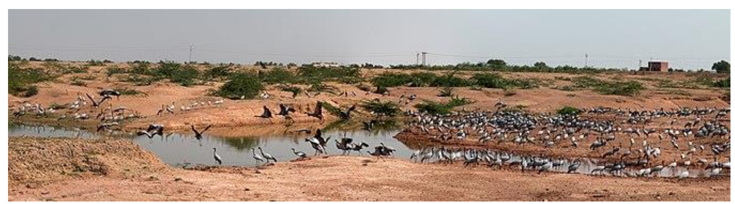
Cranes in Khichan

<u>Day 11 - Friday, February 16</u>: Morning sightseeing in Jodhpur, with focus on Mehrangarh Fort, a mighty citadel perched on a steep rock hill, allowing for a superb panorama of the bustling city below, as well as Jaswant Thada, royal cenotaphs built in white marble in a picturesque location near a lake.